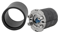
Soluția completă TB

Pentru mai multe informații, vă rugăm să vizitați roxtec.com .